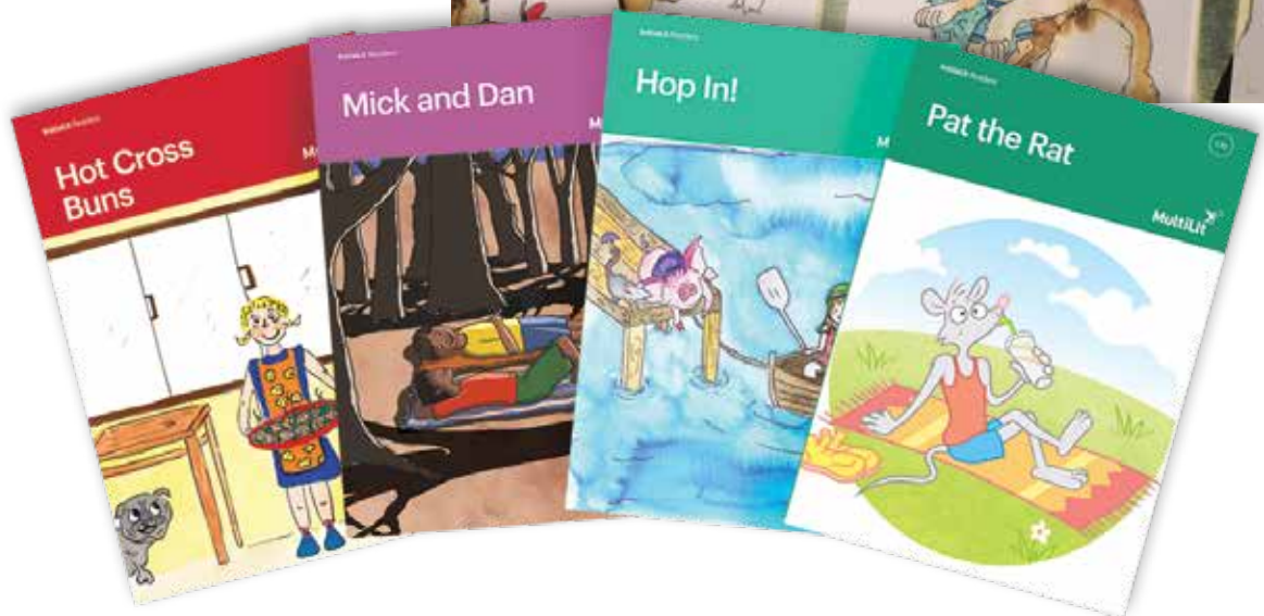
(top) Artist at work: illustrations by Rozzy Kelly in progress; (bottom) some of the 60 titles in the Initialit Readers series.